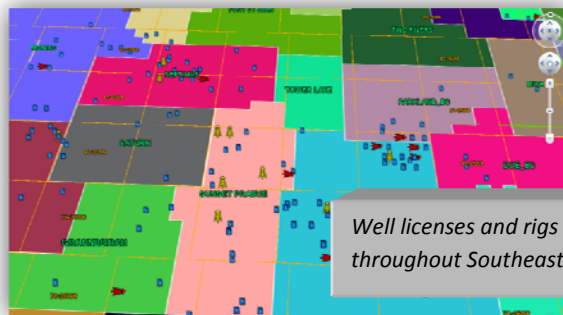
Well licenses and rigs throughout Southeast BC